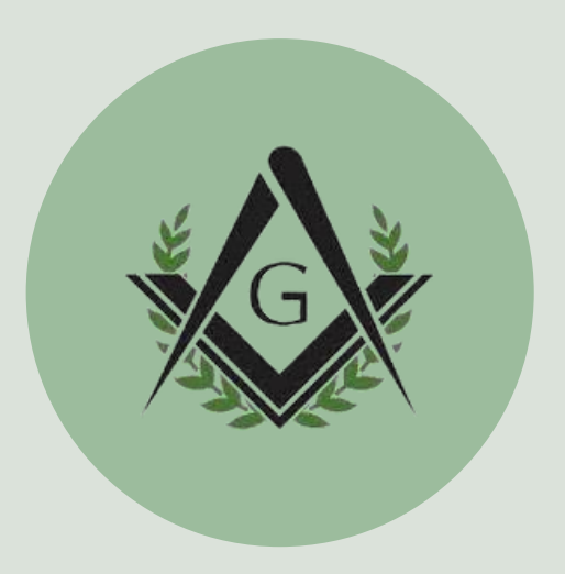
The Masonic Homes Website Find outreach materials and resources for you to print and share on masonichome.org